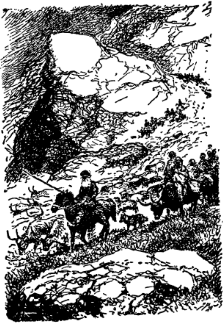
The whole village would take up their belongings and follow after the flocks