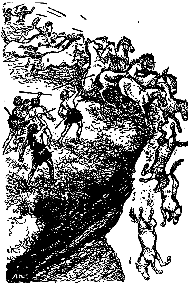
The living river tumbled over the height like a waterfall