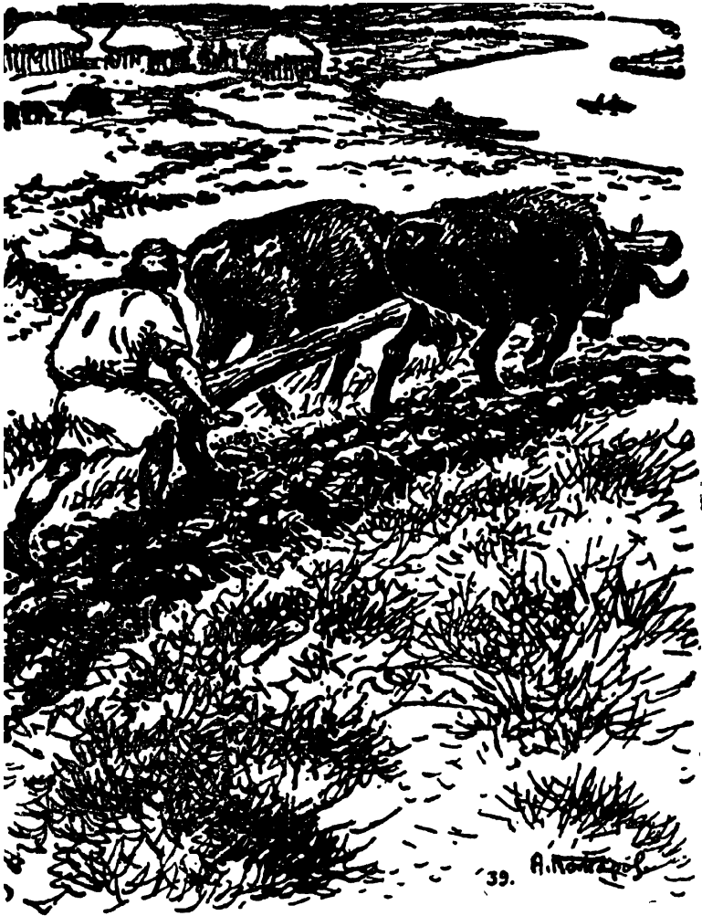
A bullock harnessed to a plough is a living motor