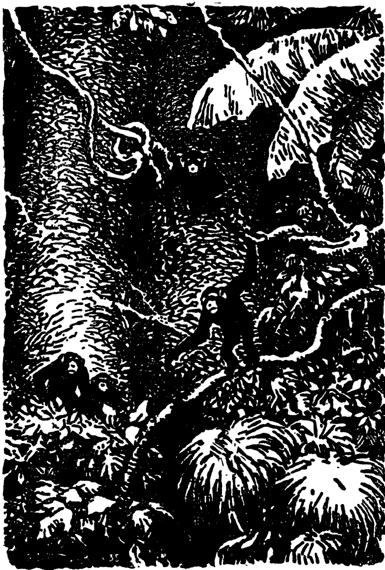
Our ancient tree-dwelling ancestors