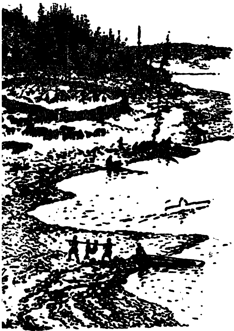
The settlement is surrounded by a high stockade