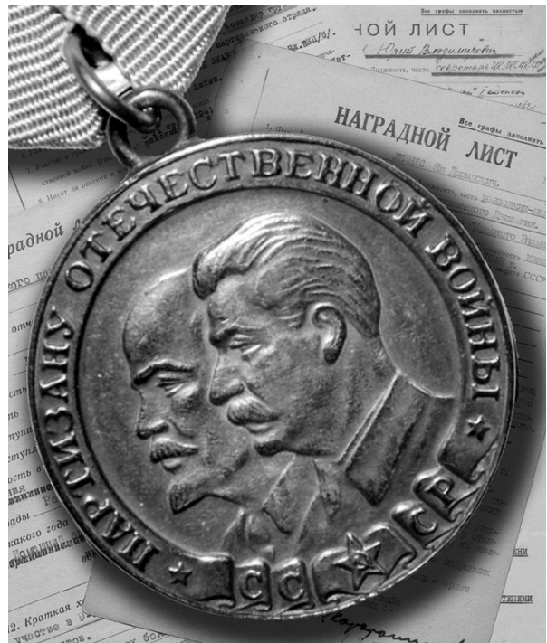
On the 75th Anniversary of the Great Patriotic War