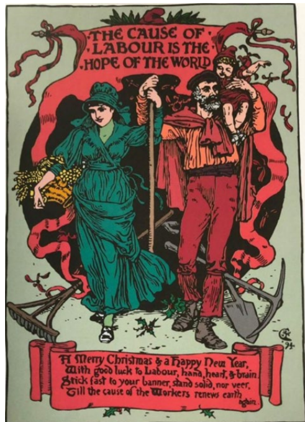
Christmas/New Year Card by Walter Crane, 1894